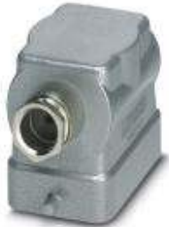
HEAVYCON B6 sleeve housing, for single locking latch, height: 56 mm, with 1 x M20 screw connection, lateral cable outlet

Please be informed that the data shown in this PDF Document is generated from our Online Catalog. Please find the complete data in the user's documentation. Our General Terms of Use for Downloads are valid ( http://download.phoenixcontact.com )