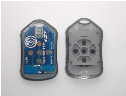
Figure 1. 4010 RKE Universal Key Fob and Plastic Case (P/N 4010-DAPB_434 and MSC-PLPB_1)