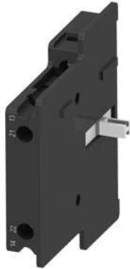
Auxiliary switch block, for 3TB52...3TB56, 3TC52, 3TC56, left