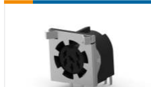
TE Part #5786676-1 6 CIRC DIN RCPT W/GRND FINGERS