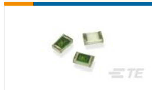
TE Part #2176093-7 RP 2A 0.25W 10K5 0.1% 25PPM 1K RL