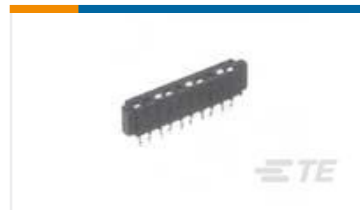
TE Part #5-520315-4 TRIOMATE ASSY V 4P L=3.556LDFR