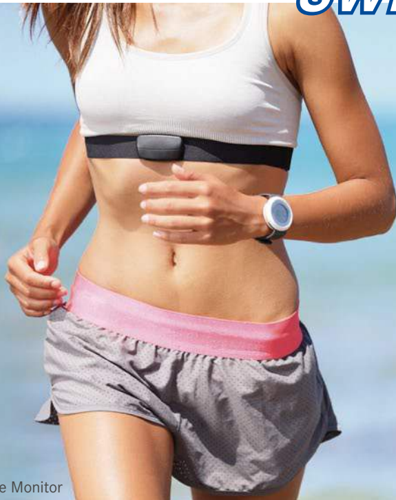
Heart Rate Monitor

Amphenol LTW introduces another breakthrough innovation SWIFT, IP67/IP68 Stand-Alone Micro-USB 2.0 the first waterproof micro-USB to blend with your wearable devices!