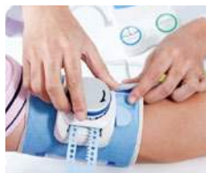
Digital Pressure Monitoring