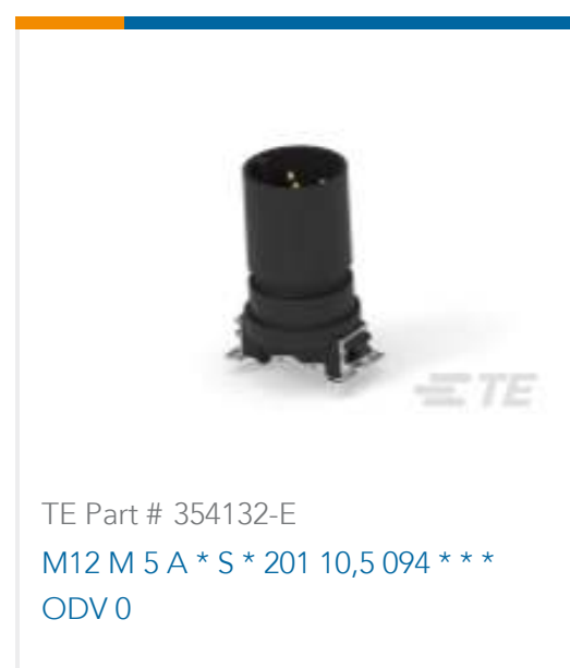
TE Part # 354132-E M12 M 5 A * S * 201 10,5