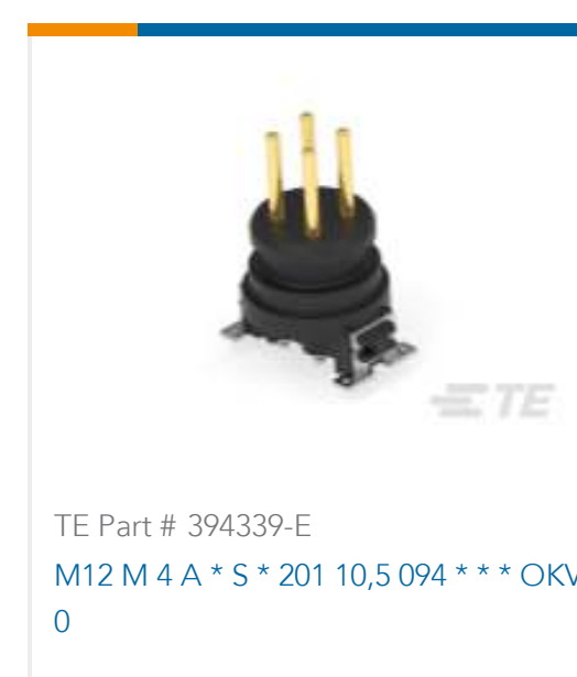
TE Part # 394339-E M12 M 4 A * S * 201 10,5