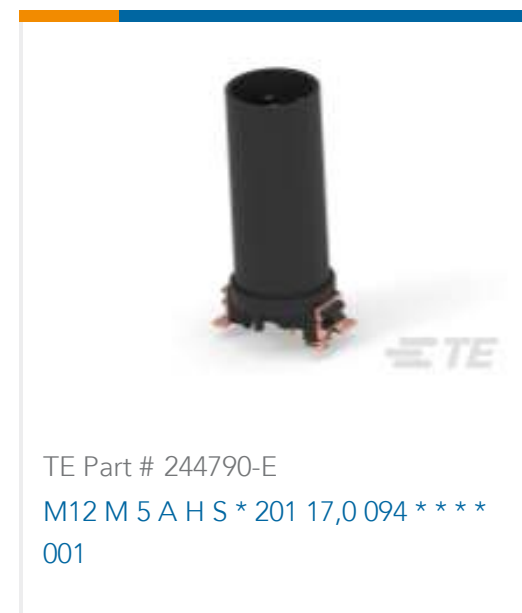
TE Part # 244790-E M12 M 5 A H S * 201 17,0