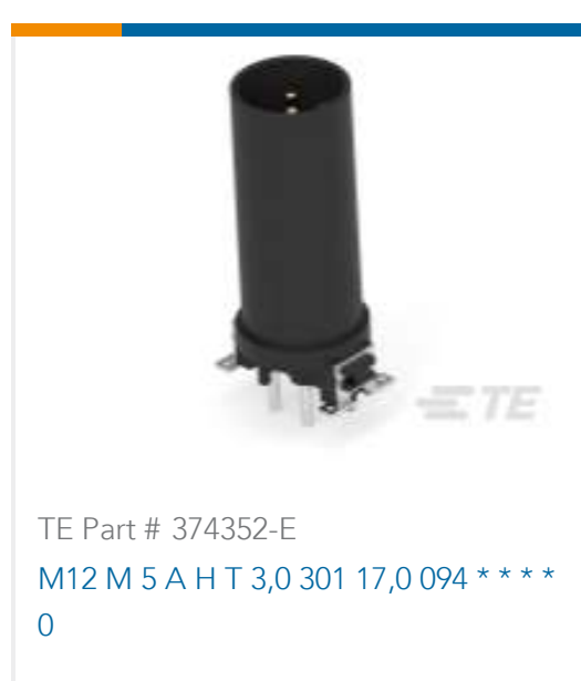
TE Part # 374352-E M12 M 5 A H T 3,0 301 17,0