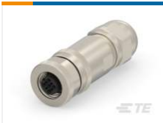
TE Part #T4110011051-000 M12 F, 5P GOLD A_CODE S SHIELDED PG7