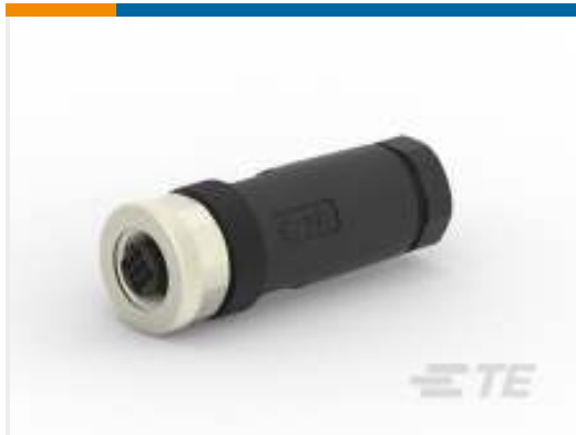
TE Part #T4110402051-000 M12,FEMALE,STRAIGHT,B CODE,5P, PG9,GOLD