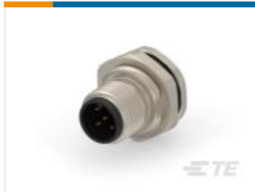
TE Part #T4171010005-001 M12,REAR MOUNTING,MALE,A,5P,0.2 M WIRE