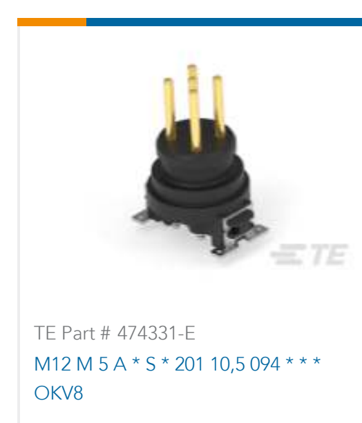
TE Part # 474331-E M12 M 5 A * S * 201 10,5