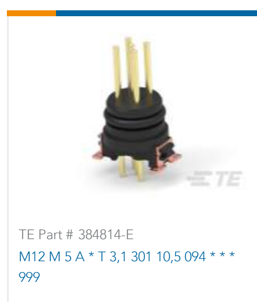
TE Part # 384814-E M12 M 5 A * T 3,1 301 10,5