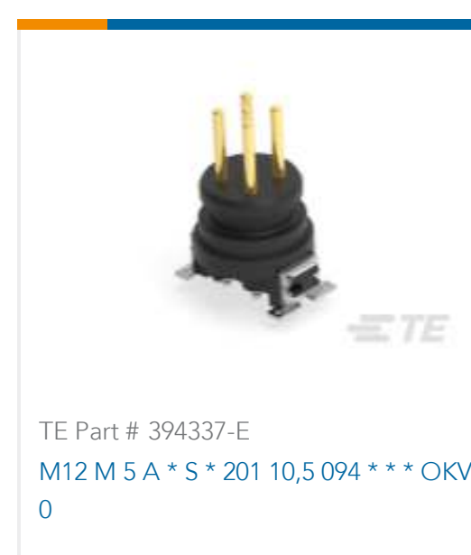
TE Part # 394337-E M12 M 5 A * S * 201 10,5