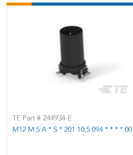
TE Part # 244934-E M12 M 5 A * S * 201 10,5