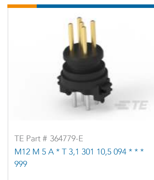
TE Part # 364779-E M12 M 5 A * T 3,1 301 10,5