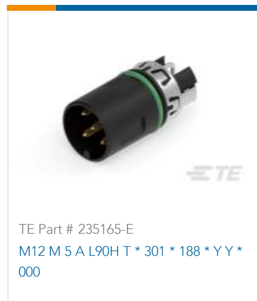
TE Part # 235165-E M12 M 5 A L90H T * 301 * 188