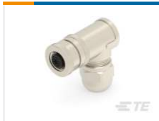
TE Part #T4112012081-000 M12 F, 8P GOLD A_CODE RA SHIELDED PG9