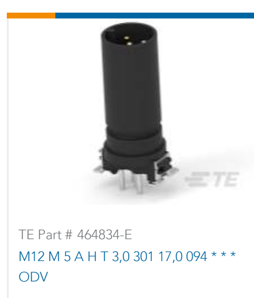
TE Part # 464834-E M12 M 5 A H T 3,0 301 17,0