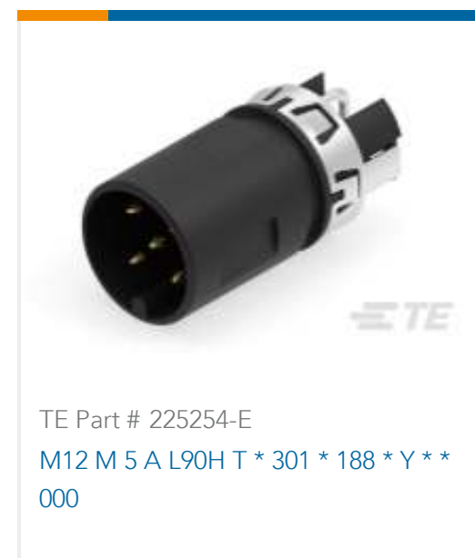
TE Part # 225254-E M12 M 5 A L90H T * 301 * 188