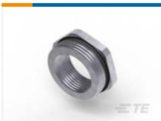
TE Part #T3167211301-000 REDU-21/13-PG