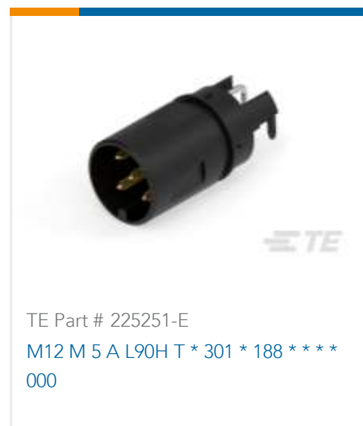
TE Part # 225251-E M12 M 5 A L90H T * 301 * 188