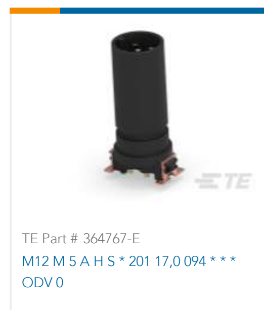
TE Part # 364767-E M12 M 5 A H S * 201 17,0