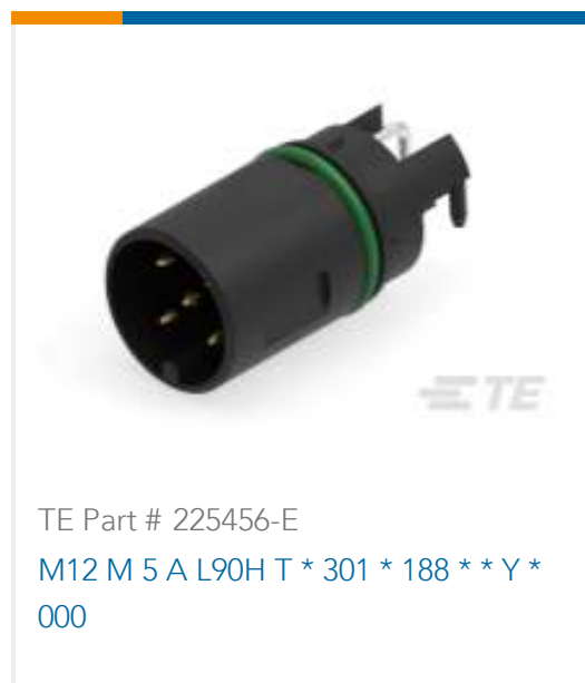
TE Part # 225456-E M12 M 5 A L90H T * 301 * 188