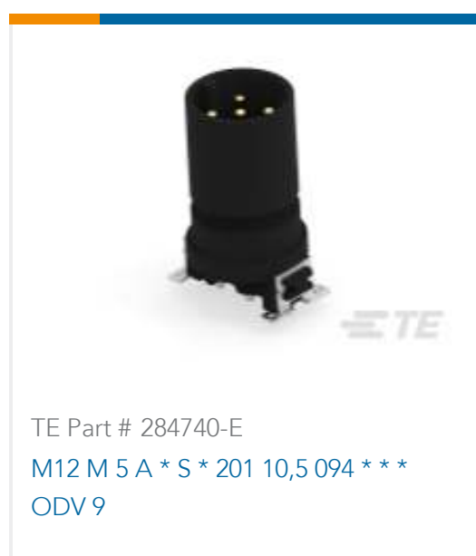
TE Part # 284740-E M12 M 5 A * S * 201 10,5