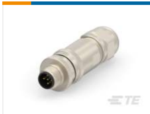
TE Part #T4111012051-000 M12 M, 5P GOLD A_CODE S SHIELDED PG9