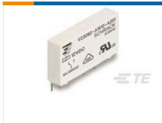
TE Part #3-1393236-0 V23092-A1024-A801