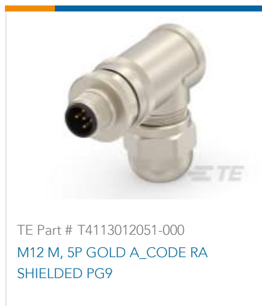
TE Part # T4113012051-000 M12 M, 5P GOLD A_CODE RA SHIELDED PG9