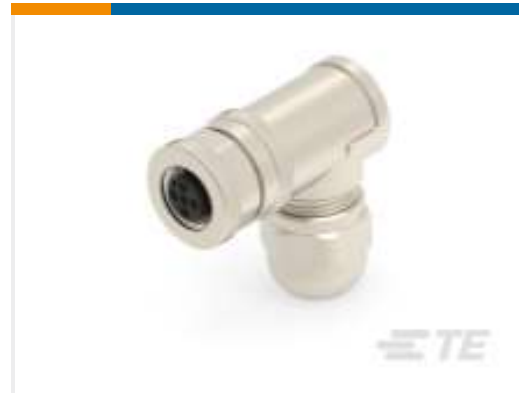
TE Part #T4112012041-000 M12 F, 4P GOLD A_CODE RA SHIELDED PG9