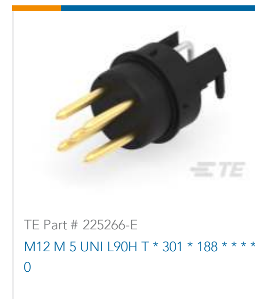
TE Part # 225266-E M12 M 5 UNI L90H T * 301 * 188