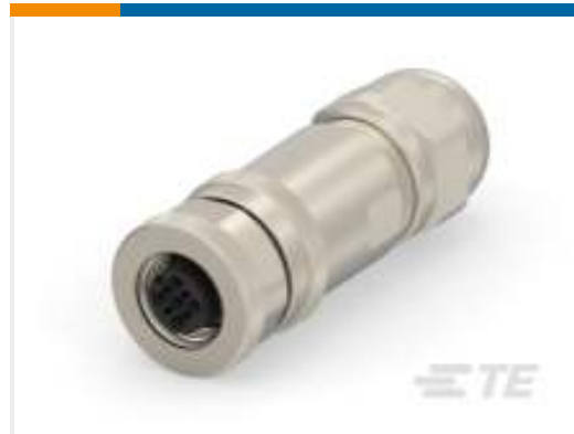
TE Part #T4110012051-000 M12 F, 5P GOLD A_CODE S SHIELDED PG9