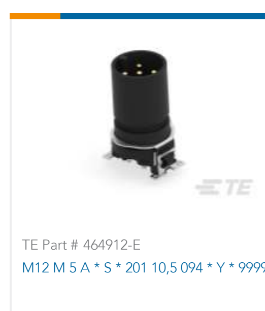
TE Part # 464912-E M12 M 5 A * S * 201 10,5