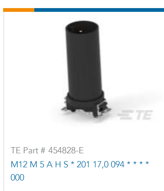
TE Part # 454828-E M12 M 5 A H S * 201 17,0