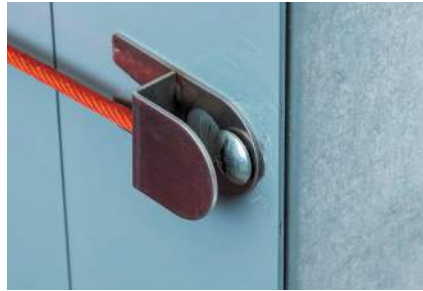
Under panel screws