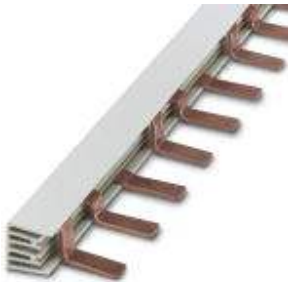
Insertion bridge, Number of positions: 36, Color: gray

Please be informed that the data shown in this PDF Document is generated from our Online Catalog. Please find the complete data in the user's documentation. Our General Terms of Use for Downloads are valid ( http://download.phoenixcontact.com )