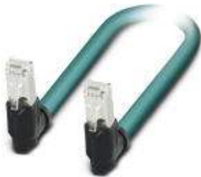
Patch cable, CAT5e, 4-pair, shielded, line, assembled at both ends with angled RJ45/IP20 heads, length: 5 m

Please be informed that the data shown in this PDF Document is generated from our Online Catalog. Please find the complete data in the user's documentation. Our General Terms of Use for Downloads are valid ( http://phoenixcontact.com/download )