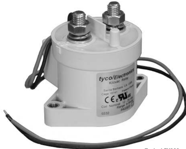
EV200 Series Contactor (CZONKA® Relay, Type III)

Typical EV200 applications include battery switching and back-up, DC voltage power control, circuit protection and safety.