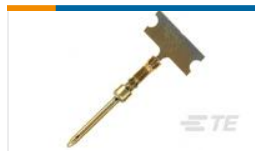
TE Part #66507-9 PIN CONTACT, 20 DF