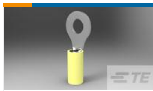
TE Part #35273 TERMINAL,PIDG R 12-10 1/4