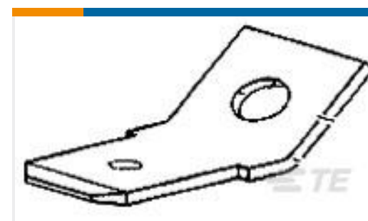
TE Part #61365-1 250 FASTON TAB TPBR