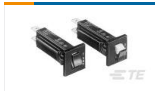
TE Part #3-1393250-2 W28-XQ1A-2=W28-