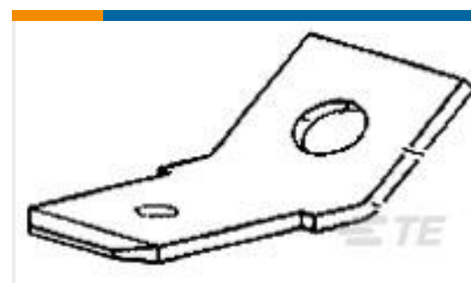
TE Part #61499-1 250 FASTON TAB TPBR