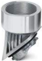
Adapter, aluminum, for EVO housing, Pg 29 thread

Please be informed that the data shown in this PDF Document is generated from our Online Catalog. Please find the complete data in the user's documentation. Our General Terms of Use for Downloads are valid ( http://phoenixcontact.com/download )