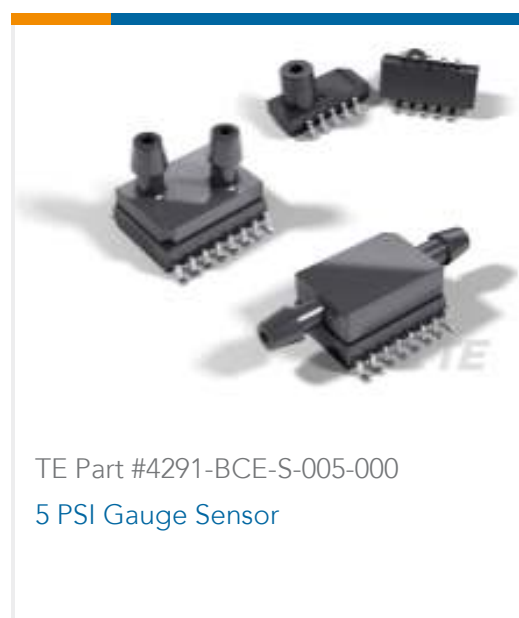
TE Part #4291-BCE-S-005-000 5 PSI Gauge Sensor