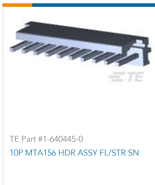
TE Part #1-640445-0 10P MTA156 HDR ASSY FL/STR SN