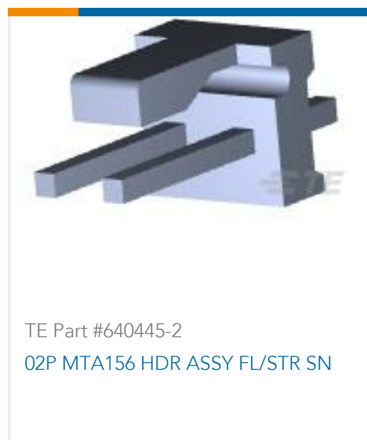
TE Part #640445-2 02P MTA156 HDR ASSY FL/STR SN