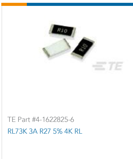
TE Part #4-1622825-6 RL73K 3A R27 5% 4K RL