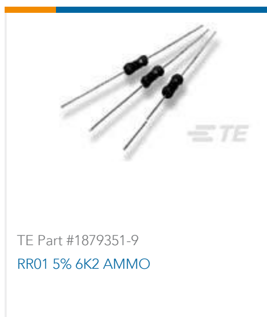
TE Part #1879351-9 RR01 5% 6K2 AMMO