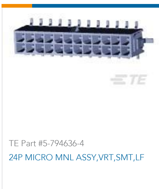
TE Part #5-794636-4 24P MICRO MNL ASSY,VRT,SMT,LF