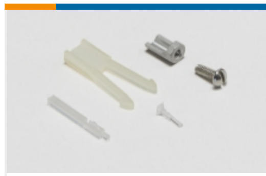
PCB Connector Keying(2)