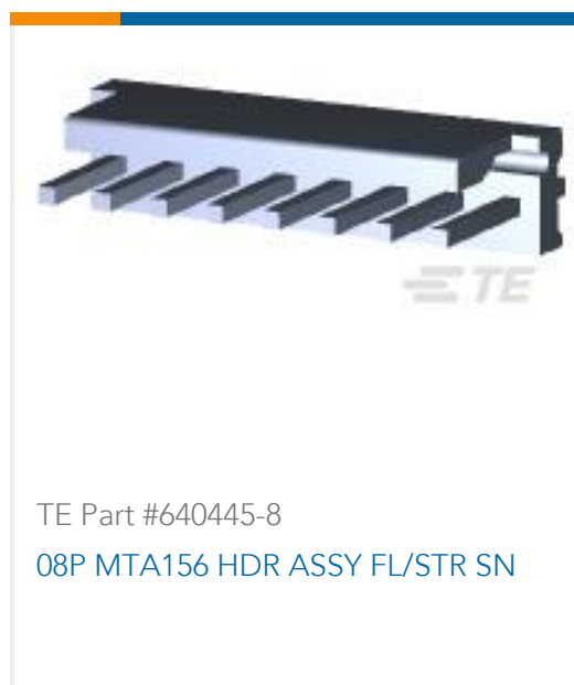
TE Part #640445-8 08P MTA156 HDR ASSY FL/STR SN