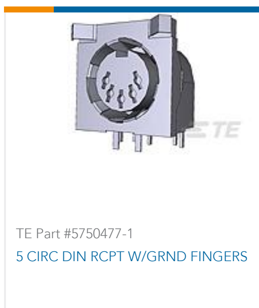
TE Part #5750477-1 5 CIRC DIN RCPT W/GRND FINGERS