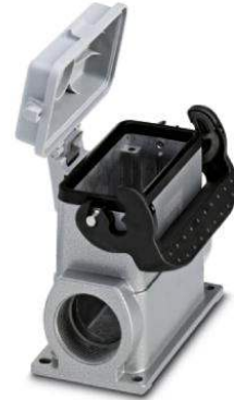
Figure shows product variant without screw connection

http://eshop.phoenixcontact.de/phoenix/treeViewClick.do?UID=1771697