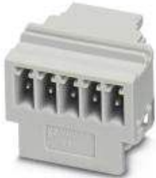
Header, Nominal current: 8 A, Rated voltage (III/2): 160 V, Pitch: 3.5 mm

Please be informed that the data shown in this PDF Document is generated from our Online Catalog. Please find the complete data in the user's documentation. Our General Terms of Use for Downloads are valid ( http://phoenixcontact.com/download )