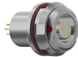
PANEL CUT OUT: