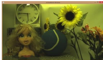
Camera Tool view mode