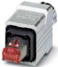
RJ45 connector, IP67, with push/pull interlocking (version 14), metal housing, for 1 Gbps, for 24 ... 25 AWG stranded conductors

Please be informed that the data shown in this PDF Document is generated from our Online Catalog. Please find the complete data in the user's documentation. Our General Terms of Use for Downloads are valid ( http://download.phoenixcontact.com )