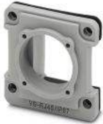
RJ45 panel mounting frame, IP67, for modular socket inserts (Keystone), for square panel cutout, with grommet, without mounting screws, color: gray

Please be informed that the data shown in this PDF Document is generated from our Online Catalog. Please find the complete data in the user's documentation. Our General Terms of Use for Downloads are valid ( http://download.phoenixcontact.com )