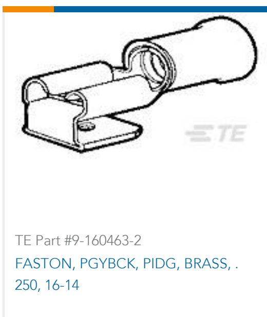
TE Part #9-160463-2 FASTON, PGYBCK, PIDG, BRASS, .250, 16-14