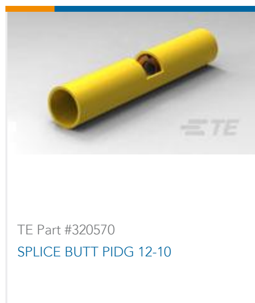
TE Part #320570 SPLICE BUTT PIDG 12-10