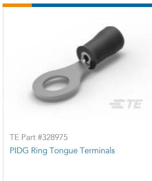
TE Part #328975 PIDG Ring Tongue Terminals