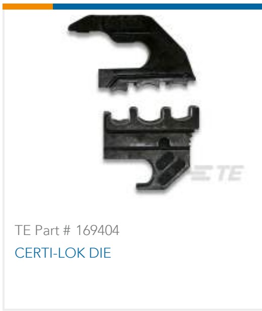
TE Part # 169404 CERTI-LOK DIE