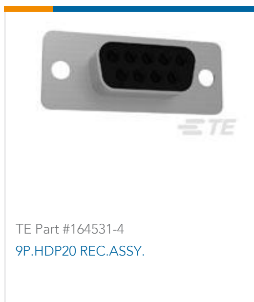
TE Part #164531-4 9P.HDP20 REC.ASSY.