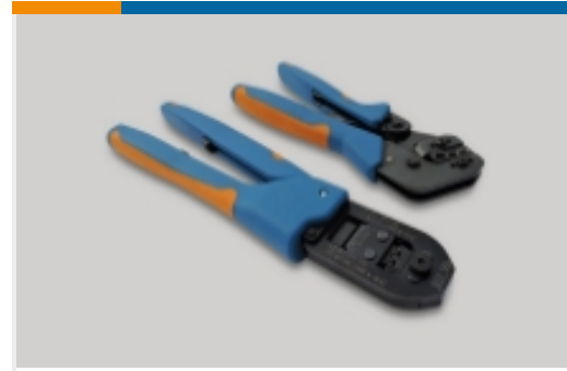
Hand Crimping Tools(2)