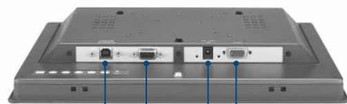
Touchscreen (USB) Touchscreen (RS-232) DC Jack 12V dc (100 ~ 240V AC adapter included) VGA Port