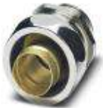
Cable gland made from brass with metric thread, IP65 protection

Screw connection - WP-G BRASS IP65 M40 - 3241064