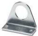
Fixing bracket for protective sleeves, fixed with two screws

Protective hose fixing bracket - WP-BASE A PG36 - 3241082