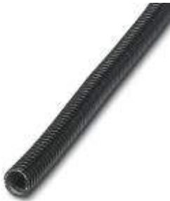
Galvanized steel protective hose with PVC coating

Please be informed that the data shown in this PDF Document is generated from our Online Catalog. Please find the complete data in the user's documentation. Our General Terms of Use for Downloads are valid ( http://phoenixcontact.com/download )