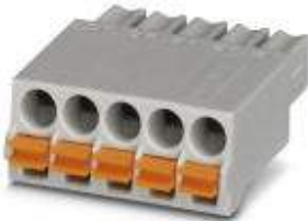
Figure shows the 5-pos. version

Plug component, Nominal current: 8 A, Number of positions: 4, Pitch: 3.5 mm, Connection method: Push-in spring connection, Color: light gray, Contact surface: Tin