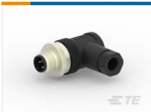
TE Part #T4113501041-000 M12,MALE,RA,D CODE,4P,PG7,GOLD