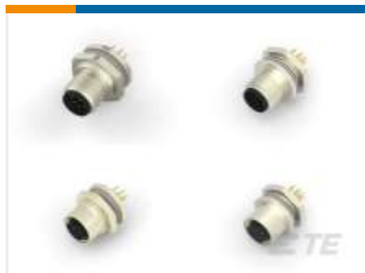
TE Part #T4140L12041-000 M12 Panel Mount PCB