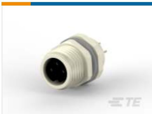
TE Part #T4041017031-000 M8.FMLE.PNLREAR.3POS.STR PCB