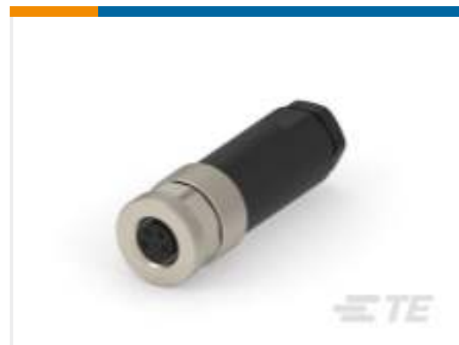
TE Part #T4010008041-000 M8,SCREW, FEMALE,S,UNSHIELD,4P, GOLD