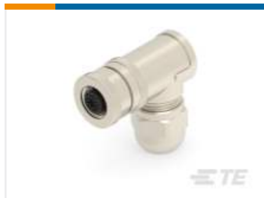
TE Part #T4112012081-000 M12 F, 8P GOLD A_CODE RA SHIELDED PG9