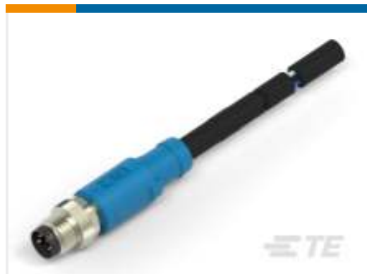
TE Part #T4061110004-002 M8 CABLE ST M 1.0M 4POS PVC CABLE