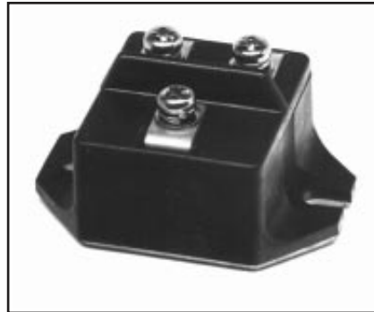
CS241020 Fast Recovery Single Diode Module 200 Amperes/1000 Volts