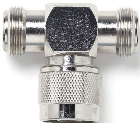
Model 73044 N Type "T" Jack-Plug-Jack Adapter