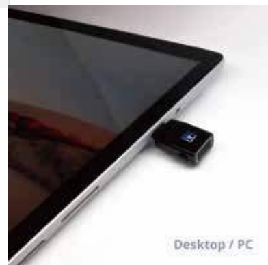
Desktop / PC