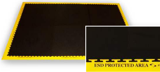
4' x 6'