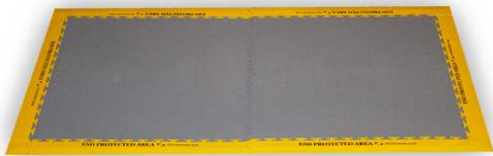
2' x 4'

Our pre-packaged kits for quick and reliable ESD mats are available with either coin or smooth texture. Kits come complete with tiles, edges, corners and a grounding cord. Made from a durable conductive vinyl composite with 20% recycled content.