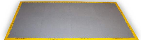
4' x 8'