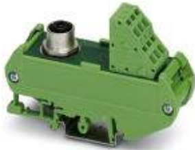
VARIOFACE module, with spring-cage terminal blocks and M12-SAC socket, 5-pos.

Please be informed that the data shown in this PDF Document is generated from our Online Catalog. Please find the complete data in the user's documentation. Our General Terms of Use for Downloads are valid ( http://phoenixcontact.com/download )