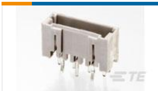
TE Part #292207-7 MINI CT SGL DIP V 7P NAT