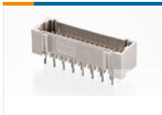
TE Part #3-292208-2 MINI CT D/R DIP 32P V NAT