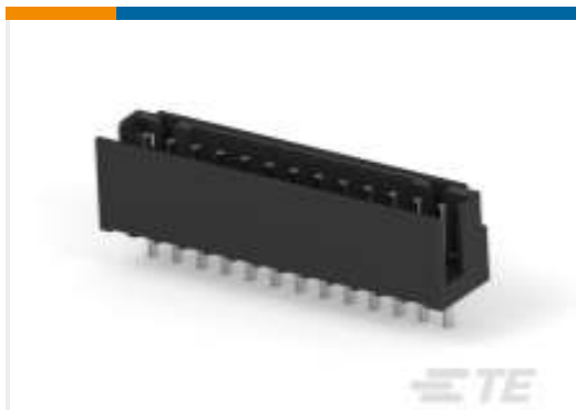
TE Part #292132-5 CT 2mm Post Header Asmbly: Box V DIP