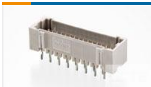
TE Part #2-292208-4 MINI CT D/R DIP 24P V NAT