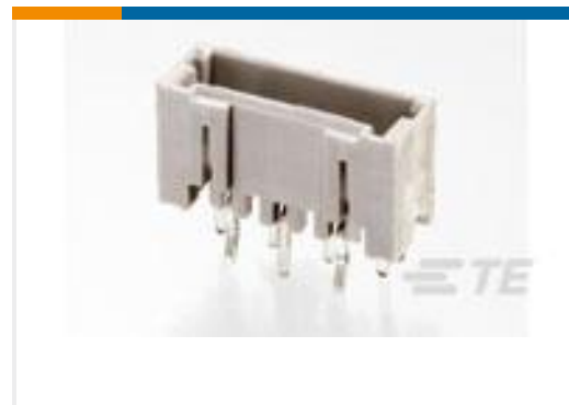
TE Part #1-292207-3 MINI CT SGL DIP V 13P NAT