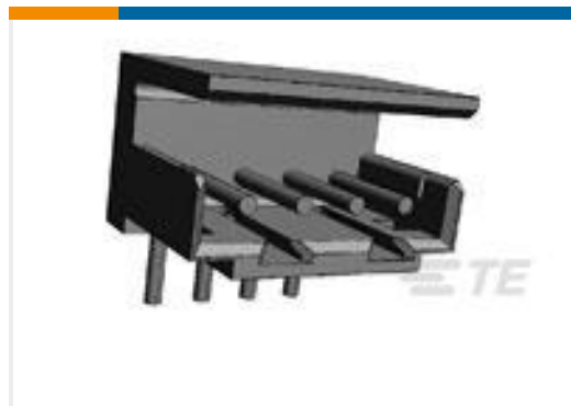
TE Part #292250-4 CT P/HDR BOX H ASSY 4P W/KINK DIP