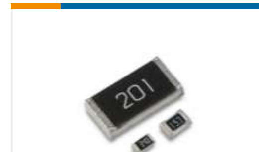
TE Part #2-2176328-9 CRGP 1206 2K2 1%