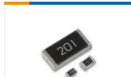
TE Part #2-2176327-1 CRGP 0805 470R 1%