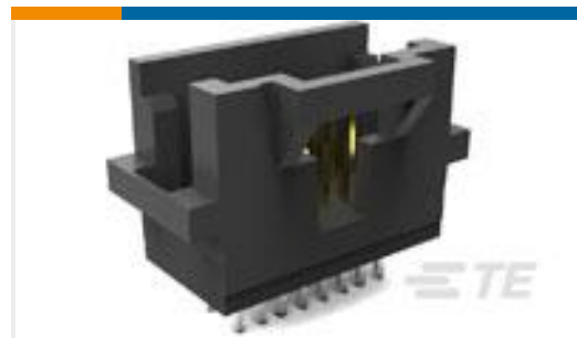
TE Part #104068-2 10 SYSTEM 50 HDR DRST SHRD