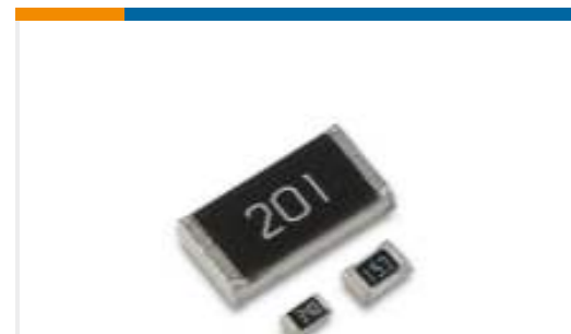
TE Part #4-2176326-6 CRGP 0603 56K 1%