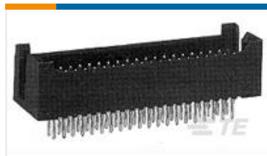
TE Part #5-102567-1 12 MODII 2PC HDR DR SHRD .100, ROHS