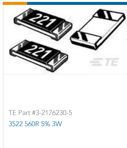
TE Part #3-2176230-5 3522 560R 5% 3W