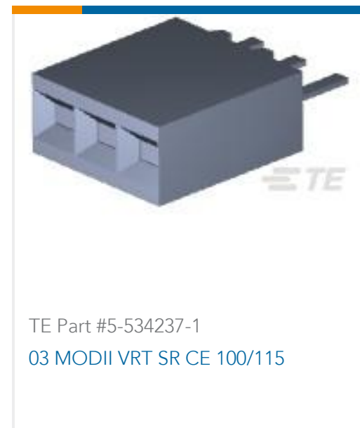
TE Part #5-534237-1 03 MODII VRT SR CE 100/115 RL