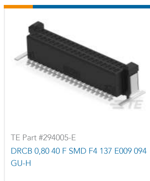
TE Part #294005-E DRCB 0,80 40 F SMD F4 137 E009 094 GU-H