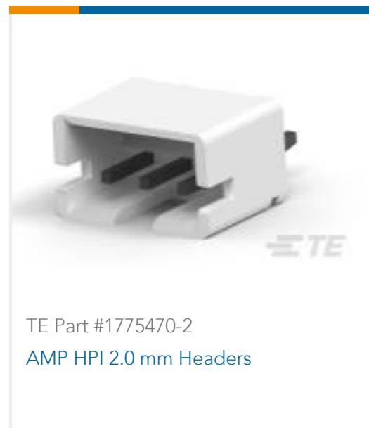
TE Part #1775470-2 AMP HPI 2.0 mm Headers