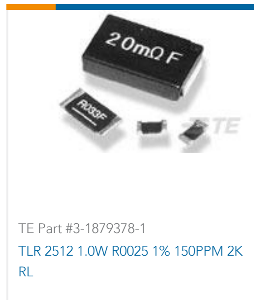
TE Part #3-1879378-1 TLR 2512 1.0W R0025 1% 150PPM 2K RL