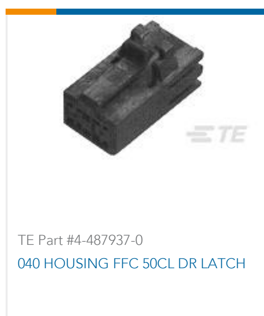
TE Part #4-487937-0 040 HOUSING FFC 50CL DR LATCH