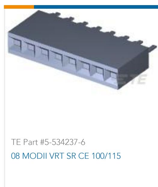
TE Part #5-534237-6 08 MODII VRT SR CE 100/115