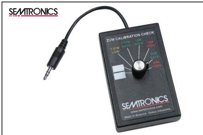
Figure 1. 62170 Limit Comparator

1. The purpose of the DUAL WIRE Limit Comparator Operator Calibration Check Resistor Box is to verify the calibration of the ZVM 62002(ZVM1002) and the 62030(SE900-1) by checking 4 operator conditions: FAIL LOW, PASS SAFE (low limit), PASS SAFE (high limit), and FAIL HIGH.