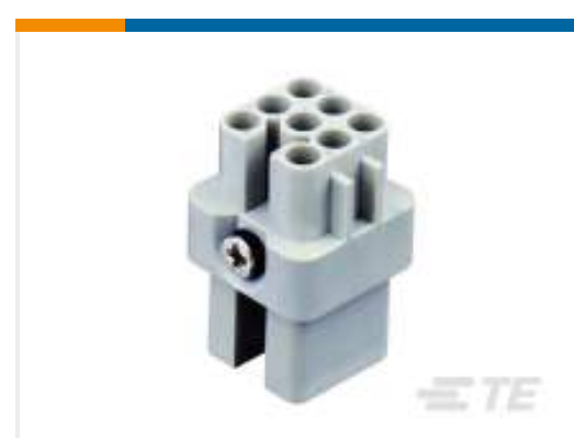
TE Part # T2020082201-000 HD-008-F