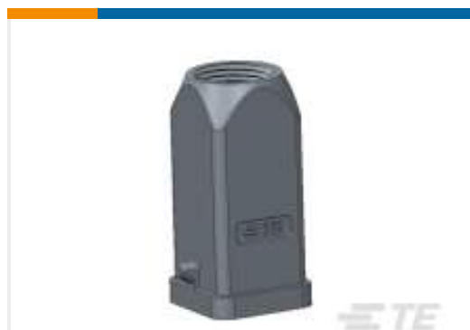
TE Part #T1329030120-000 H3A-MTG-M20