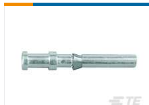
TE Part #T2020002008-000 CDF-0.75