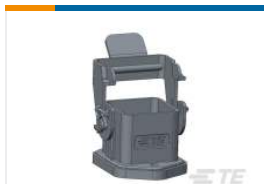
TE Part #T1509030000-000 H3A-MAG