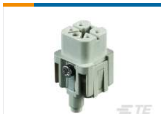
TE Part #T2010042201-000 HA-004-F