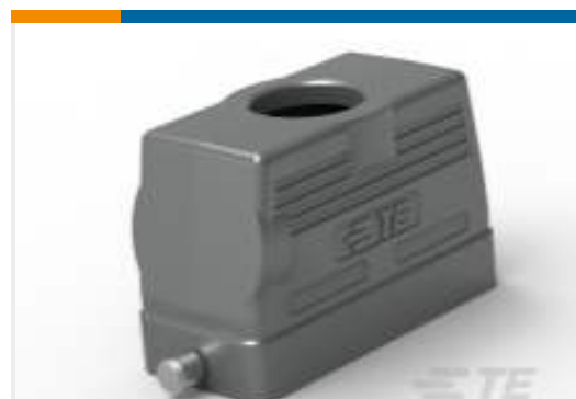
TE Part #T1320160125-000 H16B-TG-RO-M25