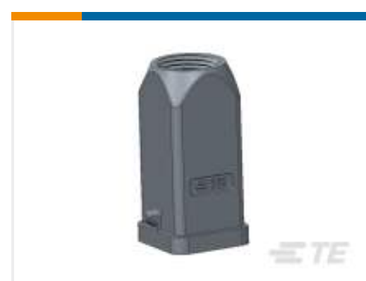
TE Part # T1329030120-000 H3A-MTG-M20