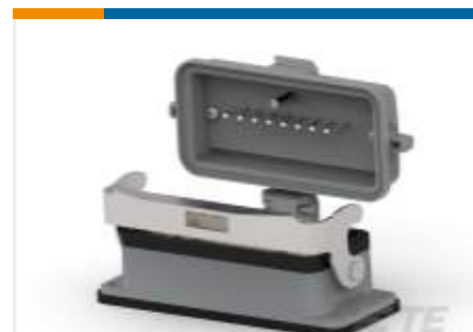
TE Part #T2120160202-000 ZGG-16DST (1-2/3-4/5-8/6-7)