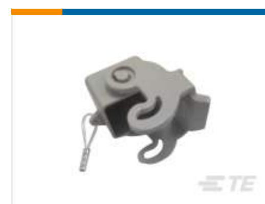
TE Part # T1010031100-000 H3A-KDTP