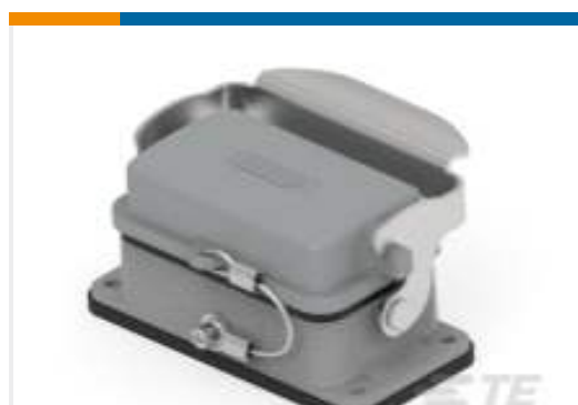
TE Part #T2120100216-000 ZGGP-H10BS(1-7/2-8/3-9/4-6/5/10)