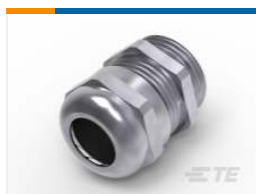
TE Part # T3609200102-000 DLX-20-M