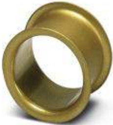
Adapter sleeve, Nominal current: 2 A, Color: pink

Please be informed that the data shown in this PDF Document is generated from our Online Catalog. Please find the complete data in the user's documentation. Our General Terms of Use for Downloads are valid ( http://phoenixcontact.com/download )