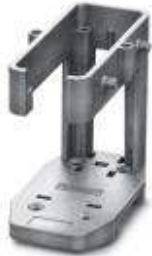
HEAVYCON plug assembly frame, lower part for double locking latch, for sleeve housing with double locking latch or HC-CIF..HFFD..., for type B16 contact inserts

Please be informed that the data shown in this PDF Document is generated from our Online Catalog. Please find the complete data in the user's documentation. Our General Terms of Use for Downloads are valid ( http://download.phoenixcontact.com )