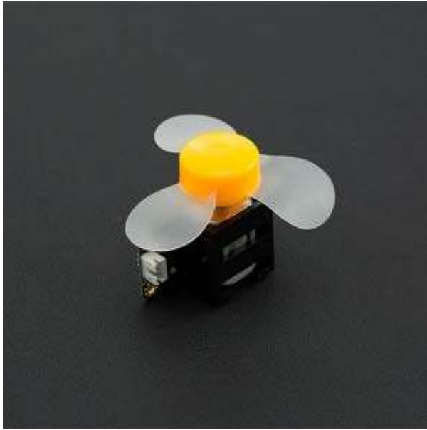
Gravity: 130 DC Motor