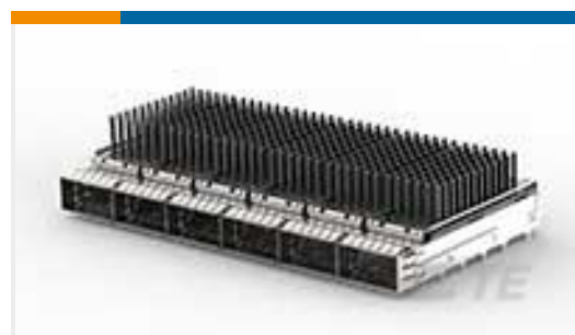
TE Part #2170707-3 CAGE ASSY, 1X6, QSFP28, SPRING, HS