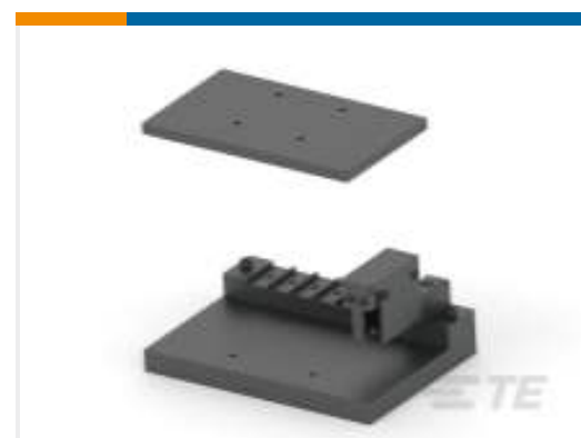
TE Part # 2215067-2 ASSY, EXTRACTION TOOL, 1 X 1