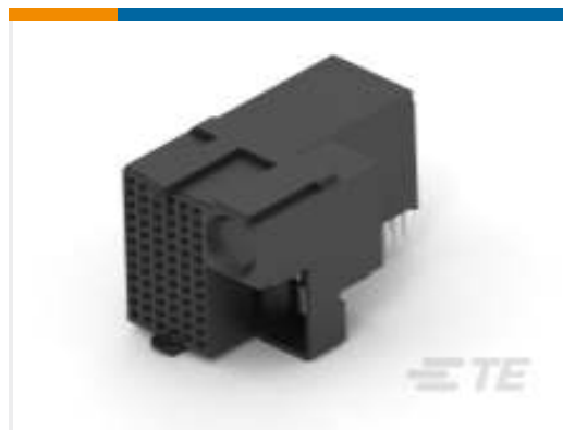
TE Part #1645570-1 12 ROW HM RA REC ASY 072P RGHT