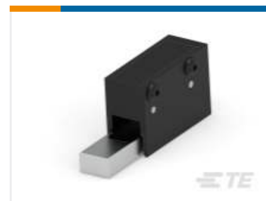
TE Part # 2215070-4 ASSY, SEATING TOOL