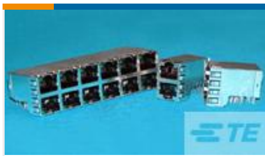
TE Part #6368062-8 2X4 OFFSET STK MJ,SHLD,W/LED