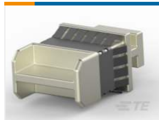
TE Part # 1888901-1 SFP+ EMI Plug