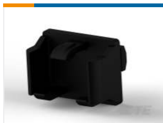
TE Part # 1761394-1 DUST COVER, SFP, GANGED & STACKED