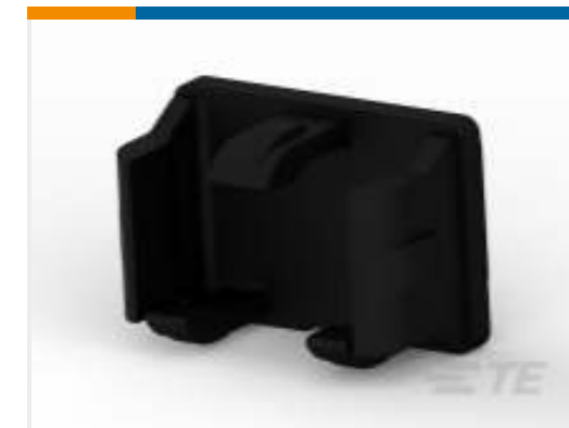
TE Part # 1367147-3 SFP COVER, UNPL, NO LOGO