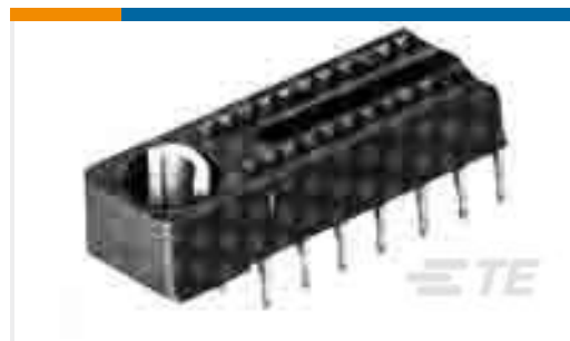
TE Part #530720-2 MINI BX-RCPT ASSY 50 POS