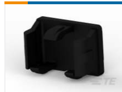
TE Part # 1367147-1 SFP COVER, UNPLATED