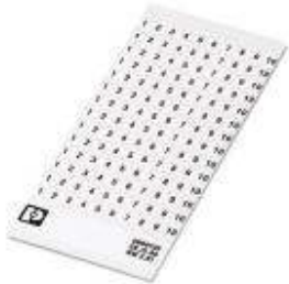
Marker cards, white, Mounting type: Adhesive, For terminal block width: 3.81 mm

Please be informed that the data shown in this PDF Document is generated from our Online Catalog. Please find the complete data in the user's documentation. Our General Terms of Use for Downloads are valid ( http://download.phoenixcontact.com )