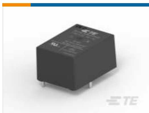
TE Part #1558660-3 T9GV5L14-12