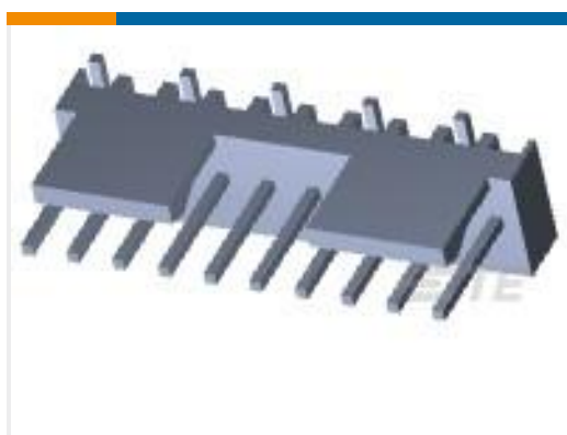
TE Part #4-647166-0 10P MTA100 HDR ASSY,SM,FL,LF