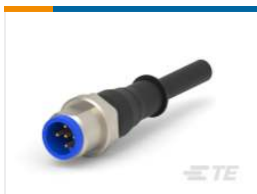
TE Part # 1-2273028-2 M12 x 1.0 straight plug pigtail A