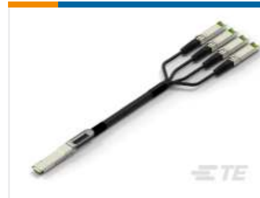
TE Part # CAT-C11-N490325 QSFP28-Four SFP+ Cable Assembly: 26 AWG