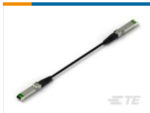
TE Part # CAT-C11-N49011 SFP28 to SFP28 Cable Assembly: 26 AWG