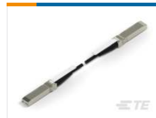
TE Part # CAT-C11-H5 SFP+ to SFP+ I/O Cable Assembly: 24 AWG