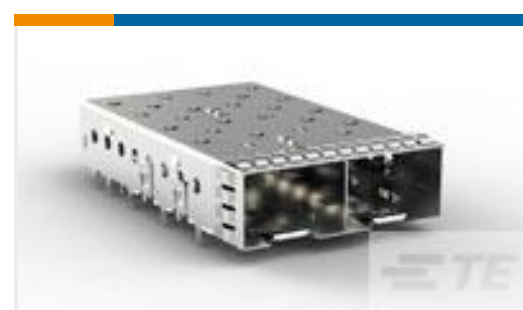
TE Part #2007263-1 SFP+ 1x2 Cage Assembly