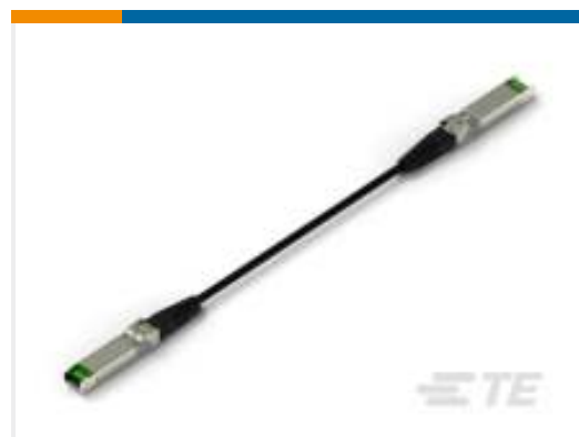
TE Part # 4-2821224-5 SFP56 DIRECT ATTACH CA, 3M, 26AWG