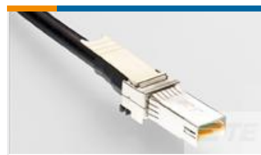
TE Part # 2142970-2 CABLE ASSY, MICRO SFP+ TO STD SFP+, 1M