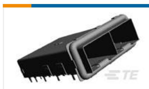
TE Part #2007181-1 SFP+ 1x2 Cage Assy, EMI Gasket