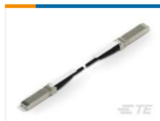
TE Part # CAT-C11-H5062 SFP+ to SFP+ I/O Cable Assembly: 28 AWG