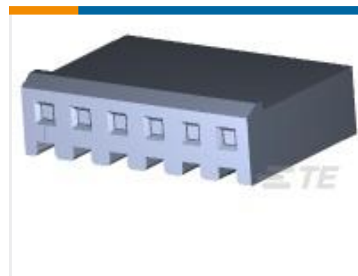
TE Part #647401-6 06P SL156 HSG W/RAMP, LRG OPEN