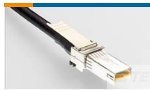
TE Part # 2142970-3 CABLE ASSY, MICRO SFP+ TO STD SFP+, 2M