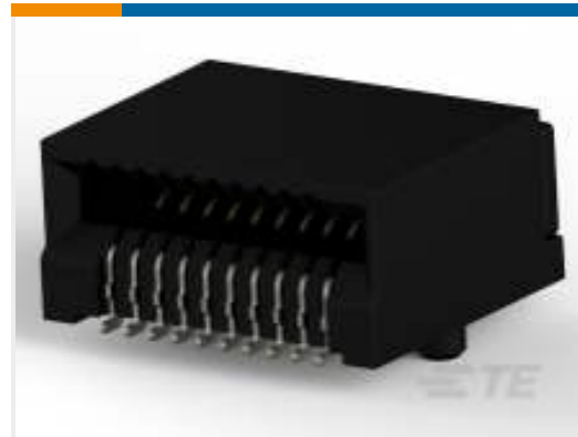
TE Part # 2110759-1 PT CONN ASSY 20 POS 16G SFP