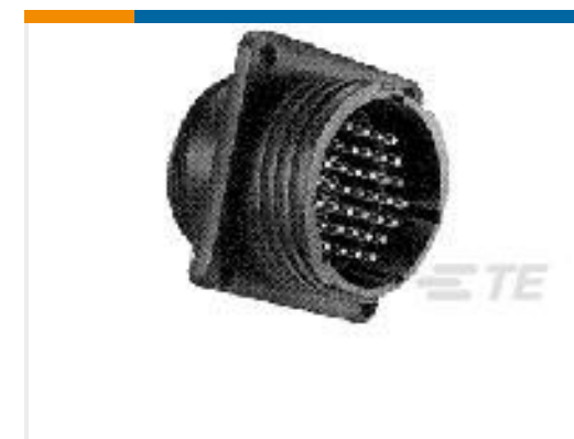
TE Part #206036-1 RECEPT, SZ 17-16 CPC