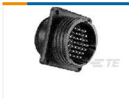
TE Part #206151-1 23-37 RECEPT STD SEX