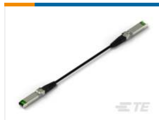
TE Part # 4-2334985-2 SFP56 DIRECT ATTACH CA, 1M, 32AWG