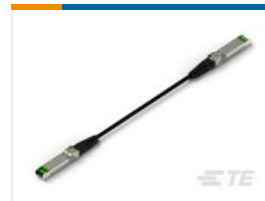
TE Part # 4-2821222-5 SFP56 DIRECT ATTACH CA, 2M, 30AWG