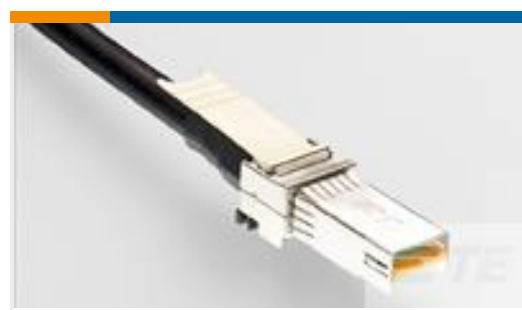
TE Part # 2142970-1 CABLE ASSY, MICRO SFP+ TO STD SFP+, 0.5M