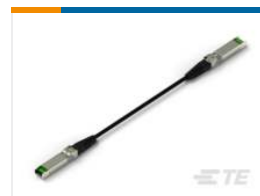
TE Part # 2334985-2 SFP28 DIRECT ATTACH CA, 1M, 32AWG