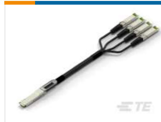
TE Part # CAT-C11-N490333 QSFP28-Four SFP+ Cable Assembly: 30 AWG