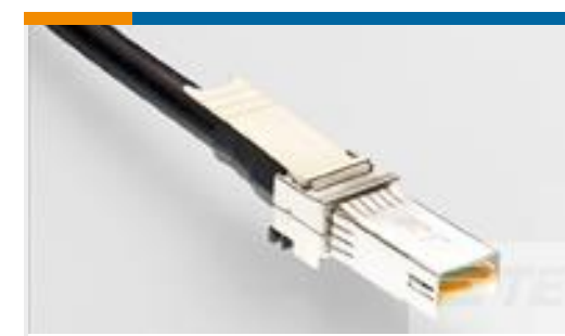
TE Part # 2142970-4 CABLE ASSY, MICRO SFP+ TO STD SFP+, 3M