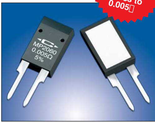
These products are covered by one or more patents, also patents pending.