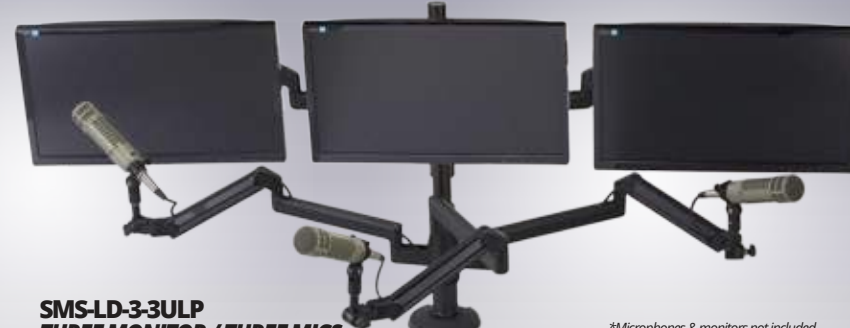
SMS-LD-3-3ULP THREE MONITOR / THREE MICS *Microphones & monitors not included.

Customize your Ultima™ SMS any way you need. This SMS-LD-2-2ULP shows how easy it is to add mic arms or monitor arms in minutes with fit-together joints and fast wire management channels.