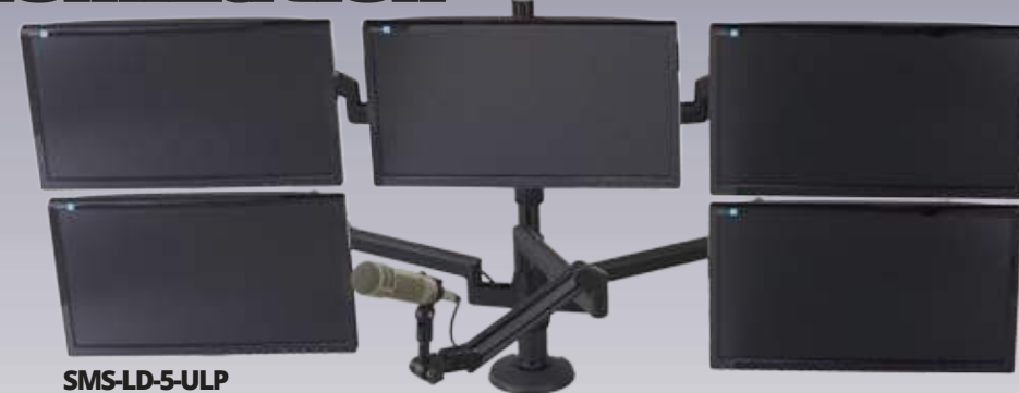
SMS-LD-5-ULP FIVE MONITOR / ONE MIC *Microphones & monitors not included.

Three guests on one system! The Ultima™ SMS-LD-3-3ULP easily adapts in minutes. Point mics and monitors in any direction for the ultimate roundtable setup!