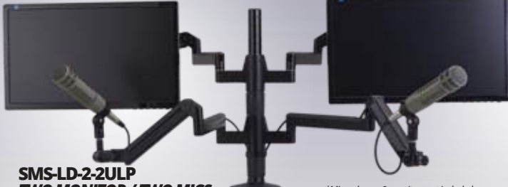
SMS-LD-2-2ULP TWO MONITOR / TWO MICS *Microphones & monitors not included.

Add a monitor arm to expand your working footprint. The SMS-LD-2-ULP comes ready for two monitors and one microphone. All Ultima™ LD arms feature hidden wire management channels for a clean look.