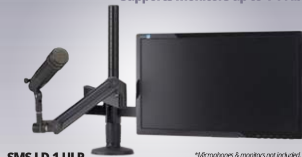
SMS-LD-1-ULP *Microphones & monitors not included.

Ultima™ SMS-LD-1-ULP is a single Mic & Monitor system with an 18" clamp/bolt through riser. 29" Mic arm supports up to 6 lb mics, Ultima™ LD arm supports up to 4-14 lb monitors.