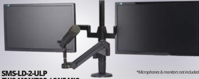
SMS-LD-2-ULP TWO MONITOR / ONE MIC *Microphones & monitors not included.

Ultima™ SMS-LD-1-ULP is a single Mic & Monitor system with an 18" clamp/bolt through riser. 29" Mic arm supports up to 6 lb mics, Ultima™ LD arm supports up to 4-14 lb monitors.