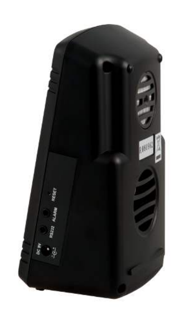
CO2 analyzer PCE-AQD 20

Air quality data logger for 5 parameters / Measures temperature, humidity, CO2, PM2.5 and air pressure / SD storage / XLS format / Large LCD / Mains and battery operation