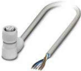
Sensor/Actuator cable, 5-position, PP-EPDM halogen-free, Gray RAL 7035, Free cable end, on Socket angled M12, A-coded, Cable length: 5 m, Hygienic design, with plastic knurl

Please be informed that the data shown in this PDF Document is generated from our Online Catalog. Please find the complete data in the user's documentation. Our General Terms of Use for Downloads are valid ( http://download.phoenixcontact.com )