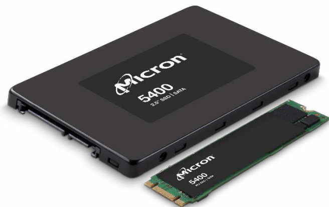
Micron 5400 SSD

Additional firmware-based security options like TCG Enterprise and TCG Opal combine with integrated, hardware-based AES 256-bit encryption for full performance plus extra security and peace of mind. 5