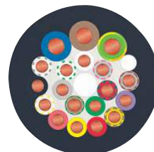
PUR halogen-free black [PUR]