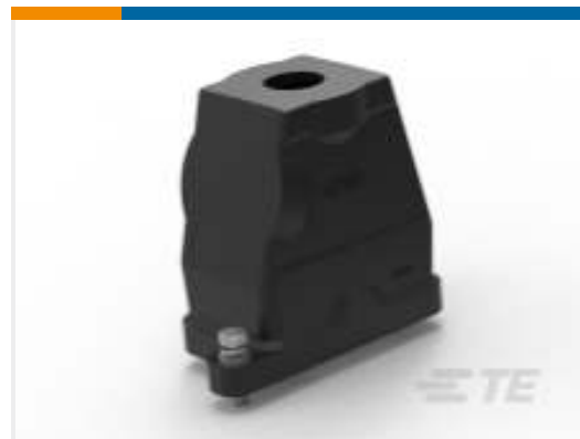
TE Part # T1920060125-009 H6BPR-TGH-M25-EMC-C