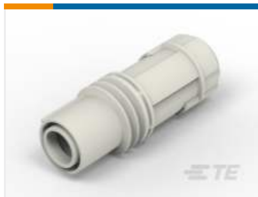
TE Part # T2193503201-000 HCM350-FC