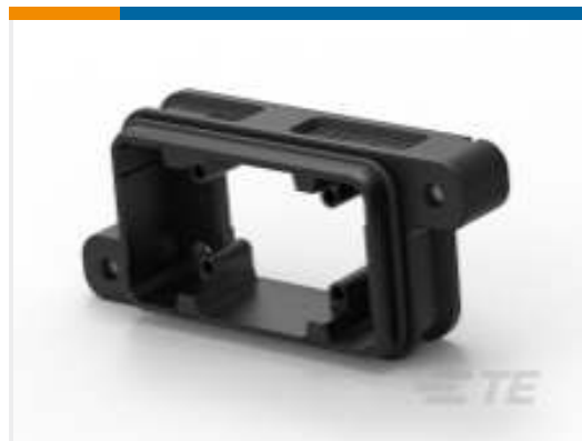
TE Part # T1930060000-009 H6BPR-AG-EMC-C