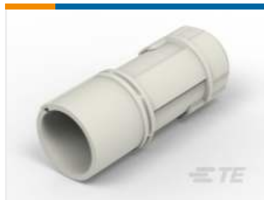
TE Part # T2193503101-000 HCM350-MC