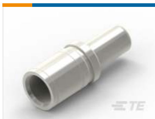
TE Part # T2193501120-000 HCM350-MC-120