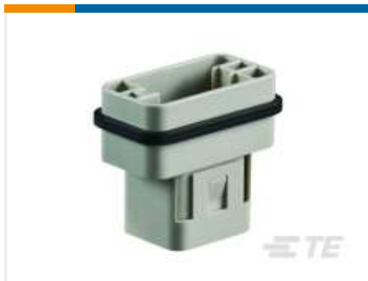
TE Part # T2019092101-000 HQ-008-M