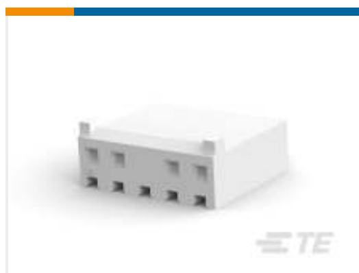
TE Part # 647344-5 05P SL156 HSG W/RP TB BLK #3