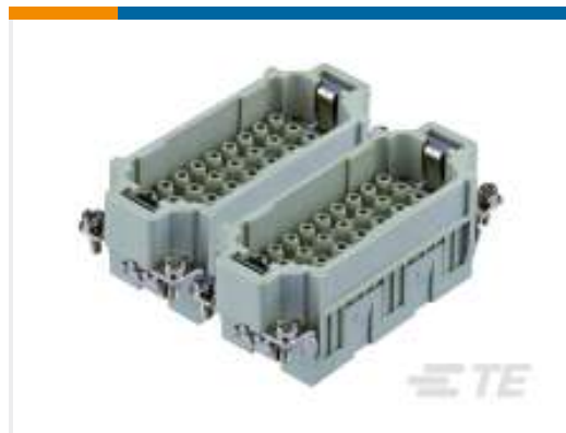
TE Part # T2051283101-000 HEEE-064-M 65-128