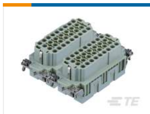
TE Part # T2051283201-000 HEEE-064-F 65-128