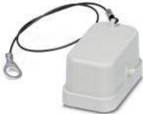
Protective cover for HC-COM-K housing... for female contact inserts

Please be informed that the data shown in this PDF Document is generated from our Online Catalog. Please find the complete data in the user's documentation. Our General Terms of Use for Downloads are valid ( http://download.phoenixcontact.com )