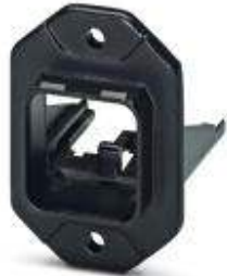
RJ45 panel mounting frame, IP67, for push-pull interlocking, plastic, with the Freenet system, for square panel cutout, with grommet, without mounting screws

Please be informed that the data shown in this PDF Document is generated from our Online Catalog. Please find the complete data in the user's documentation. Our General Terms of Use for Downloads are valid ( http://download.phoenixcontact.com )