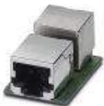
RJ45 socket insert, for the Freenet system, CAT5e, 8-pos., shielded, socket on socket

RJ45 female insert - VS-08-BU-RJ45-5-F/BU - 1652952