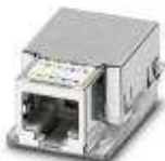
RJ45 socket insert, for the Freenet system, CAT5e, 8-pos., shielded, with cable connection (IDC fast connection), for solid wires AWG 24 ... 22

RJ45 female insert - VS-08-BU-RJ45-5-F/PK - 1652936